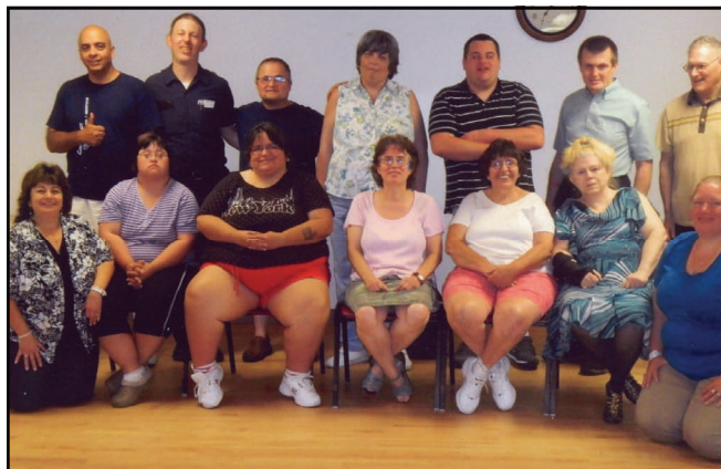
(Pictured Right: People Power Group)